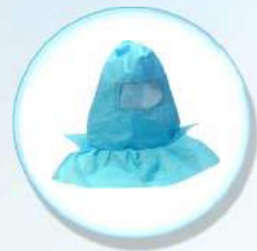
Protective Hood with Visor