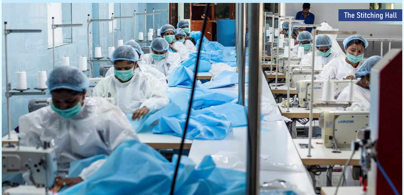
The Stitching Hall