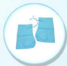
Pair of Shoe Covers