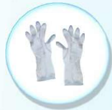
Pair of Gloves